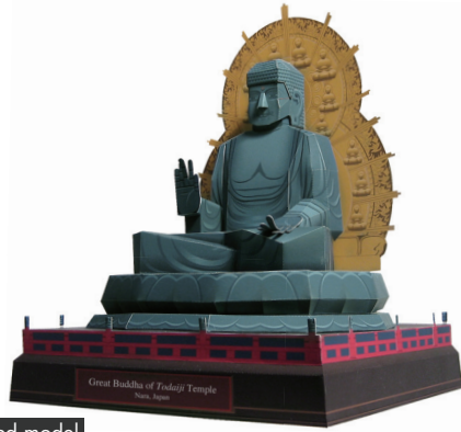
View of completed model

*This model was designed for Papercraft and may differ from the original in some respects.